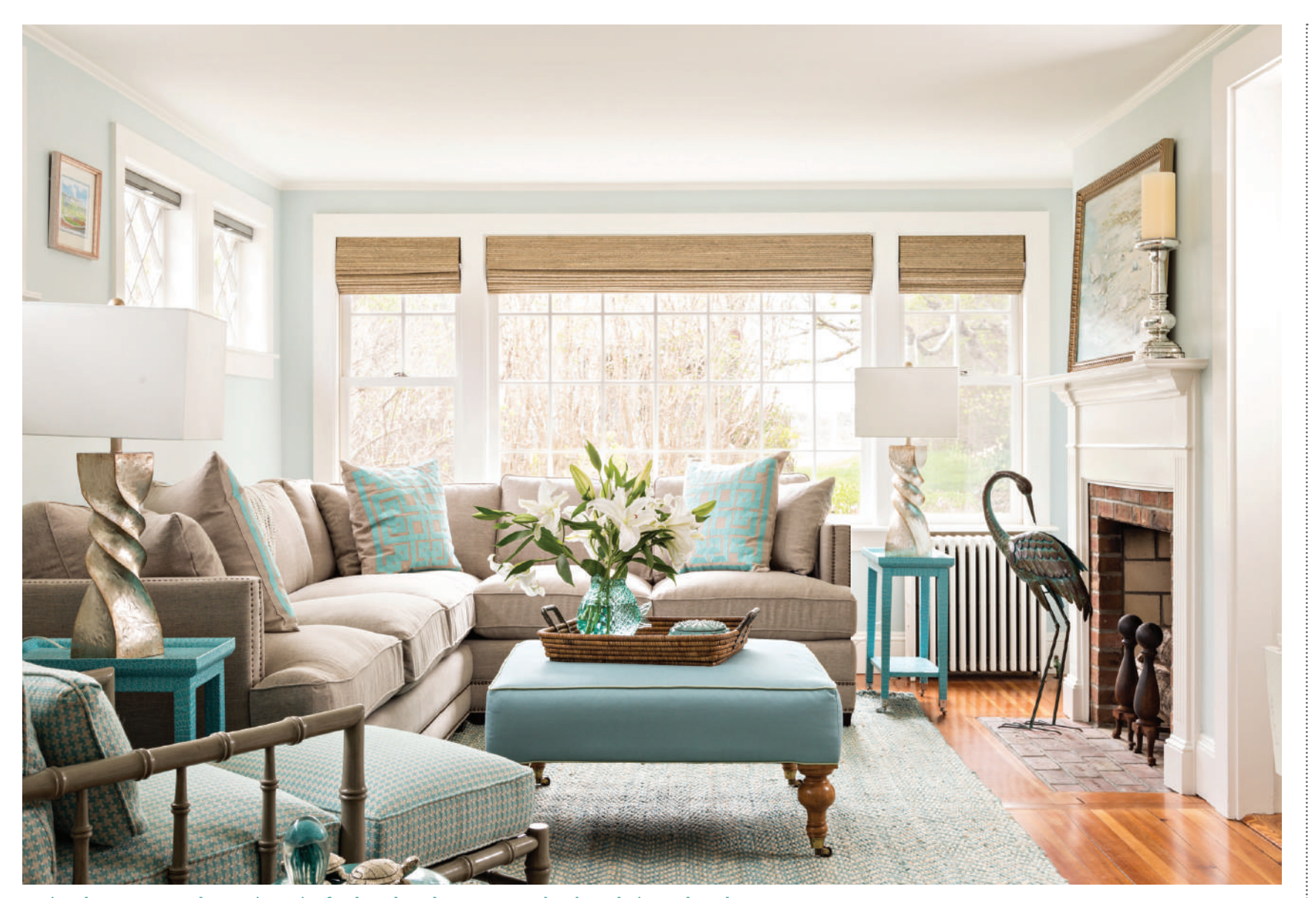
Having chosen aqua as the starting point for the color scheme, Laura Urban brought in sands and grays.

"I tried to make it a fun, whimsical house," says Urban, who, favoring an eclectic style, introduced a variety of textures and finishes. In addition to faux crocodile, jute and rattan, there is wicker, dark wood, bleached wood and mirrors rimmed with shells. She also added touches that are lighthearted without being cutesy, like a jolly ceramic fish as the dining table centerpiece, and an avian motif in the kitchen window-treatment fabric that is carried through the house by ornamental birds on candlesticks and birdshaped coat hooks.