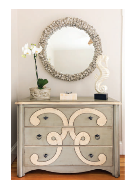
In the master bedroom, curves are featured in the bureau design and a circular, shell-rimmed mirror.

We "started with blues, and then brought in sands and grays," explains Urban. Instead of a traditional shade like royal or navy, Urban splashed "Ocean Air" by Benjamin Moore on the walls, a color that is tranquil yet arresting. Accented by earth tones and neutrals, the overall effect is fresh and even sophisticated, but not at all stuffy.