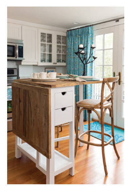
A table with a fold-down top allows sit-down meals in the small kitchen.

Drawing from the homeowner's collection of artwork, including framed, old Massachusetts maps, Urban personalized the décor. There's a map of Chatham in the living room and one of Fenway Park in the master bedroom. "I like to incorporate a person's collections or family heirlooms so that the house looks like it's been done over time," notes Urban.